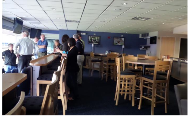
Another party suite – rough life

After a great lunch and a stimulating presentation, there was only one more thing to do... TOUR THE STADIUM.